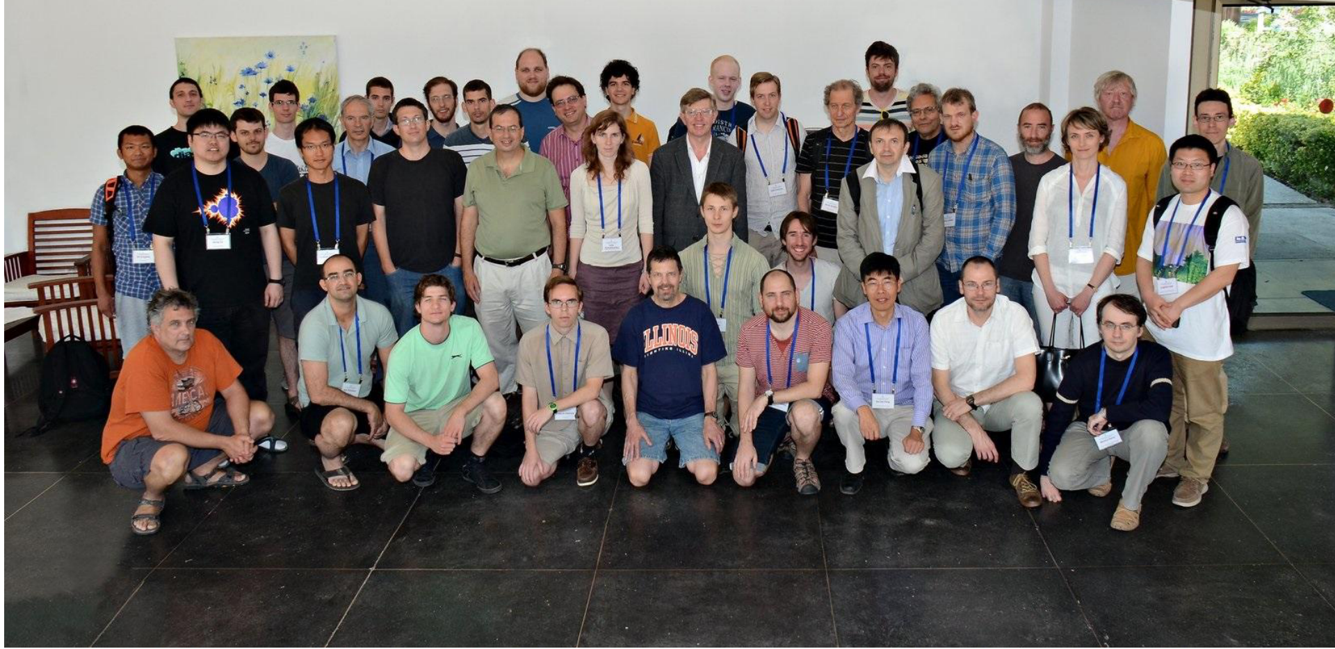
Workshop on Fractals Maison de France, The Hebrew University of Jerusalem, June 2014

<-Her PhD was used "in practice" in April 2015 during the partial solar eclipse.